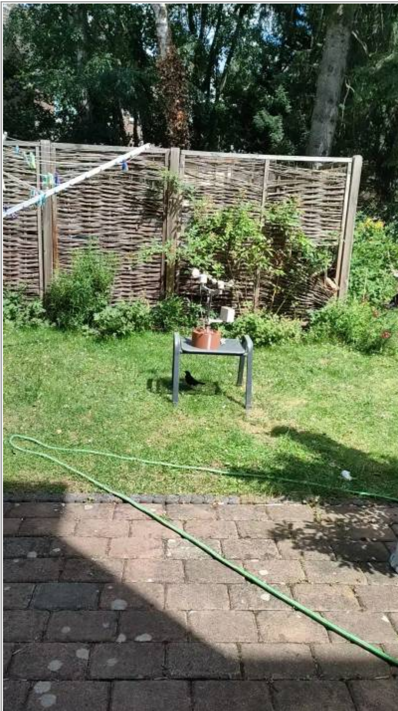
Fig.: HSRW Portable Weather Station