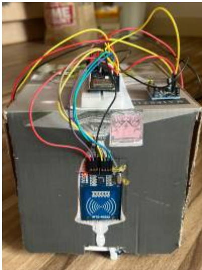
Fig. 2: Prototype 1.0