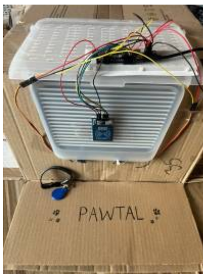
Fig. 3: Prototype 2.0