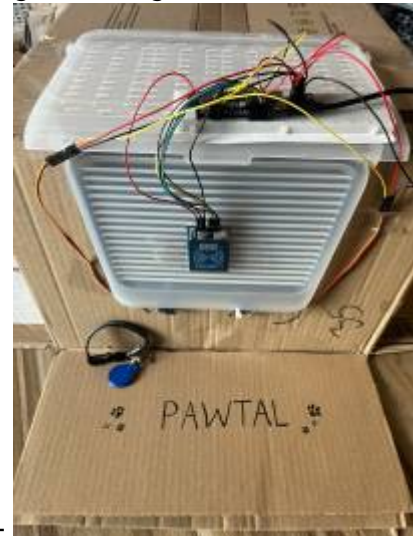
Fig. 3: Prototype 2.0