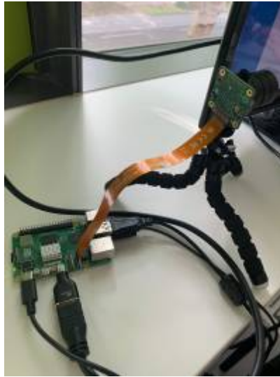
Fig. 1: System Build