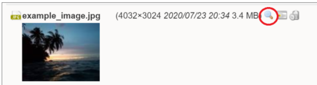
Figure 4: The magnifying glass opens the new tab

Afterwards you need to upload your image to dokuwiki and get the image link. You can get it when you click in the dokuwiki media files onto the magnifying glass which opens a new tab with the image in full resolution. You need to copy the URL from the tab and save it for later.