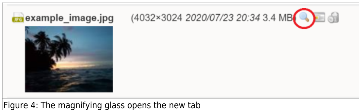
Figure 4: The magnifying glass opens the new tab

Afterwards you need to upload your image to dokuwiki and get the image link. You can get it when you click in the dokuwiki media files onto the magnifying glass which opens a new tab with the image in full resolution. You need to copy the URL from the tab and save it for later.