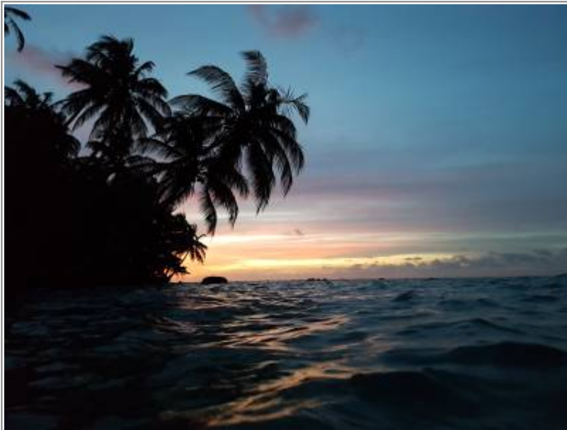
Figure 1: Our example image.

Below you see an image I use here as an example. I want to make three clickable areas which link to different webpages. The palm tree will link to google, the sunset to Wikipedia and the sea to YouTube. Of course, you can change the image and the links however you want. I used it in my project to make an interactive navigation to the different pages of my report. You can for example add an image of a schematic of your project and add links leading to the different pages describing the components.