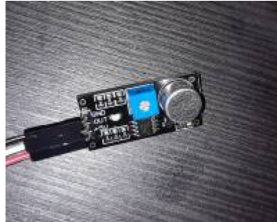
Figure 4: LM393 Microphone Sound

Specifications: The working voltage is 3.3-5V.