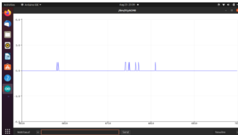
Figure 7 : Serial Plotter: Adjustment of the sensor sensitivity using the potentiometer

First, the digital output of the sound sensor is checked directly on the serial monitor (laptop), and the sensitivity of the sensor is adjusted to a reasonable level (see figure 7).