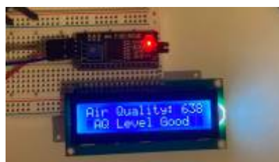
Figure 5: Liquid Crystal Display (LCD) screen (16 x 2) paired with I2C

https://core-electronics.com.au/tutorials/use-lcd-arduino-uno.html http://www.handsontec.com/dataspecs/module/I2C_1602_LCD.pdf