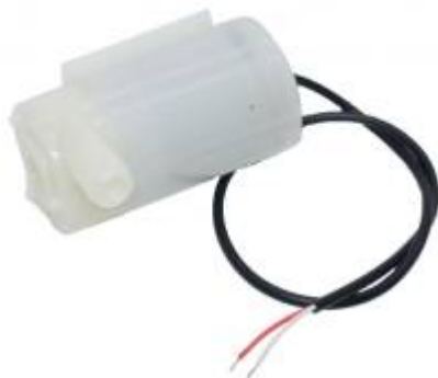
Figure: Submersible water pump, https://cf3.s3.souqcdn.com/item/2018/09/25/38/88/28/88/item_XL_38882888_151555394.jpg

The water pump is supposed to transport water from the storage tank through tubes into the soil. The pump works with an electrical motor that spins a mechanical rotational part, the rotor, which pushes water in an enclosure from an inlet to an outlet and thus creates a flow of the water.