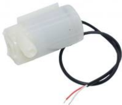
Figure: Submersible water pump, https://cf3.s3.souqcdn.com/item/2018/09/25/38/88/28/88/item_XL_38882888_151555394.jpg

The water pump is supposed to transport water from the storage tank through tubes into the soil. The pump works with an electrical motor that spins a mechanical rotational part, the rotor, which pushes water in an enclosure from an inlet to an outlet and thus creates a flow of the water.