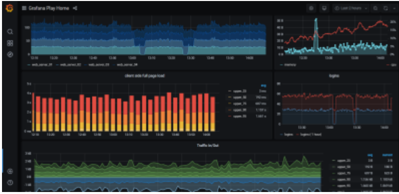
Figure: Grafana example dashboard,

https://www.sqlshack.com/wp-content/uploads/2020/06/grafana-dashboard-demo.png