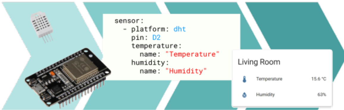
Figure: ESPHome example configuration and sensor displayed in Home Assistant, https://esphome.io/_images/hero.png

When used inside Home Assistant, the ESP32 can quickly be integrated and the sensor readings to be configured as a sensor in HA.