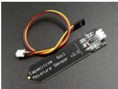
Figure: Capacitive soil moisture sensor,

Resistive measurement induces a DC current and measures electrical conductivity between two metal plates (electrodes). Soil resistance increases with drought, as less water can conduct the current. A comparator activates a digital output when an adjustable threshold is exceeded. This type of sensor is known to have issues with corrosion in long-term use, as the voltage together with the water quickly corrodes the metal of the sensor. It also has shown to lack accuracy of measurements.