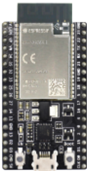
Figure: ESP32-DevKitC_V4 with ESP32-WROVER-B, https://www.espressif.com/sites/default/files/dev-board/ESP32-DevKitC%28ESP32-WROVER-E%29_0.png