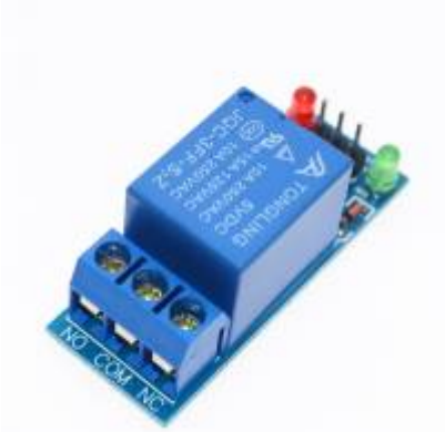
Figure: Relay module, https://www.stephenwenceslao.com/sites/default/files/1-relay-module4.jpg

A relay can safely close a circuit when activated by an external DC current. Thus this electrical switch can be activated by a controlled electrical signal.