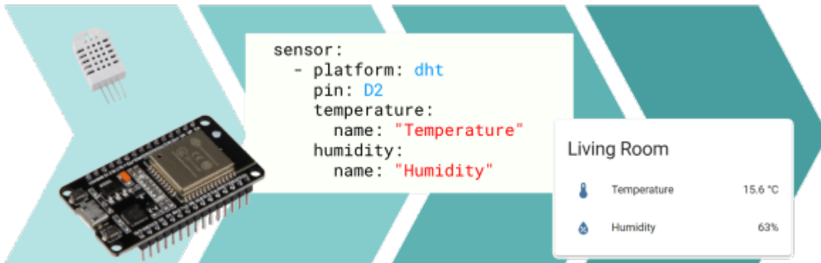
Figure: ESPHome example configuration and sensor displayed in Home Assistant, https://esphome.io/_images/hero.png

When used inside Home Assistant, the ESP32 can quickly be integrated and the sensor readings to be configured as a sensor in HA.