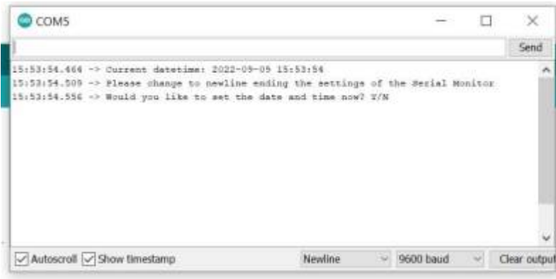
Fig. 5: Setting the time in the serial monitor