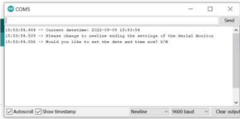
Fig. 5: Setting the time in the serial monitor

The project went through different development phases. The circuit as well as the code have been changed over time. Every sensor was tested separately before combining the system together. At first, the LCD display was set up as the basis of the project as described above. Then the DHT11 was added next. After that, the RTC was initiated and incorporated to print the time on the LCD. Lastly, the MQ135 was calibrated and added to the system. Initially, the LCD showed the heat index obtained by the DHT11, which was replaced by the CO 2 concentration. Because of lacking space on the display, the concentration is not displayed with its appropriate unit (ppm) and CO 2 had to be abbreviated as "C". The calibration and troubleshooting process for the MQ135 is further described in the chapter Results and Discussion.