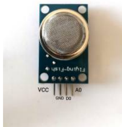
Fig. 3: MQ135 sensor Module

The MQ 135 is a sensor that measures the concentration of CO 2 and other gases in air. It needs a 5V power supply to operate and has a working current of 150mA. The module has one digital and one analog pin for data output. The material used to sense the gas concentration is SnO 2 which is a metal oxide semiconductor which changes its resistance in contact with gases. R_0 is the internal resistance of the sensor in clean air, and R_s is the resistance of the sensor in contact with different gases. With the R_0 and R_s values the concentration in ppm can be calculated. The stainless steel mesh layer as seen in figure 3 is there to protect the sensor from particular matter and other disturbances.