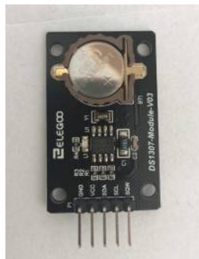
Fig. 4: RTC DS1307 Module

The DS1307 is a real-time clock module which can be used to measure time. Once the RTC is initialized by setting it to the current time including year, month and day of the week it continuously counts time. It needs a supply voltage of 5V. If the main power source is disrupted the RTC switches its power supply to a 3V button battery to ensure the continuous measurement of time.