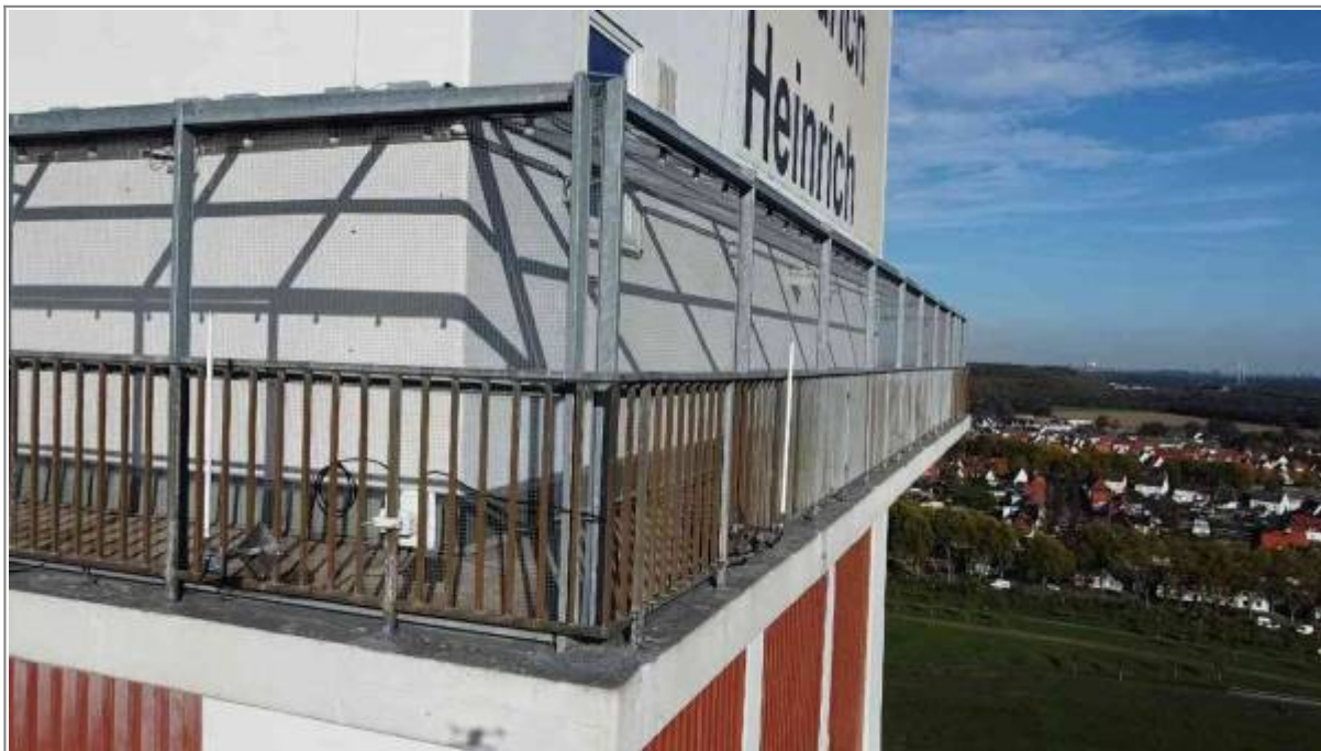
Fig.: The two rod antennas at the southwest corner of the tower of the former Friedrich-Heinrich colliery.

This allows for many devices to communicate with them at the same time. The gateways are placed on the northern corner and on the southern corner of the tower with antennas facing in all directions then.