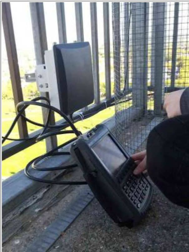
Fig.: Using a vector network analyzer to tune the antenne performance.

manufacture multiple ones made from stainless steel. These enabled us to specifically tune the distance from the metal cage for each individual antenna. Therefore we used our Network Analyzer which enables us to see the frequency at which the antennas are able to receive data.