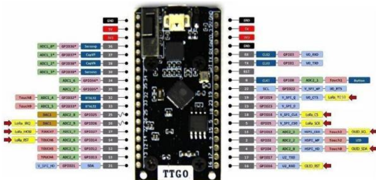
Fig.: TTGO LoRa32 OLED V1, bottom view .