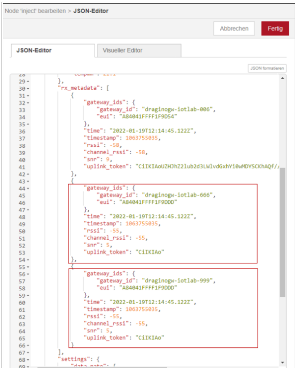
Figure 18: Test data

The first gateway is the gateway from the original message, all other gateways and their ids were made up to test the entire flow and database. The initial injection node containing the modified json file has five connections to other nodes.