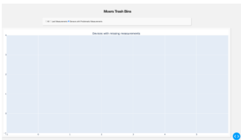
Figure 53: Problematic Measurements

In the below figure you will show more detailed information about our project