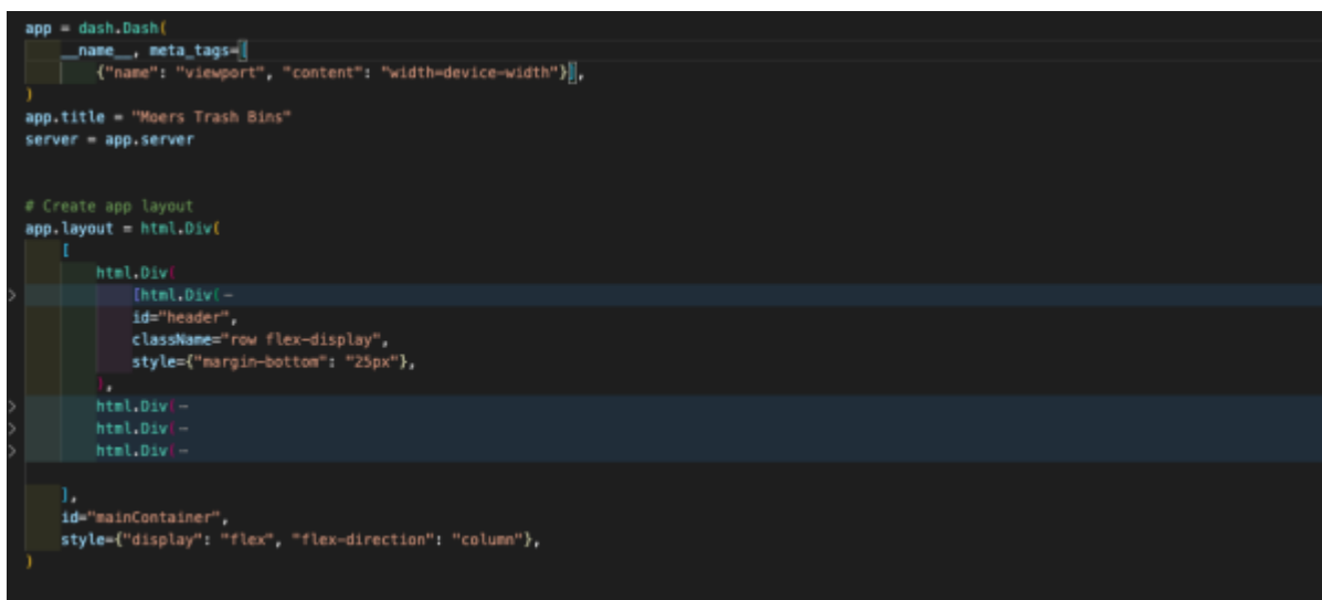
Figure 50: Dash Layout

In the figure below you will see how our layout is structured and what's included.