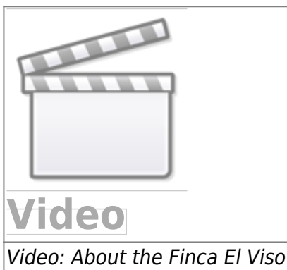
Video: About the Finca El Viso

El Viso is the perfect place to demonstrate state of the art IoT technologies supporting organic farming.