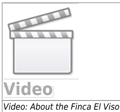
Video: About the Finca El Viso

El Viso is the perfect place to demonstrate state of the art IoT technologies supporting organic farming.