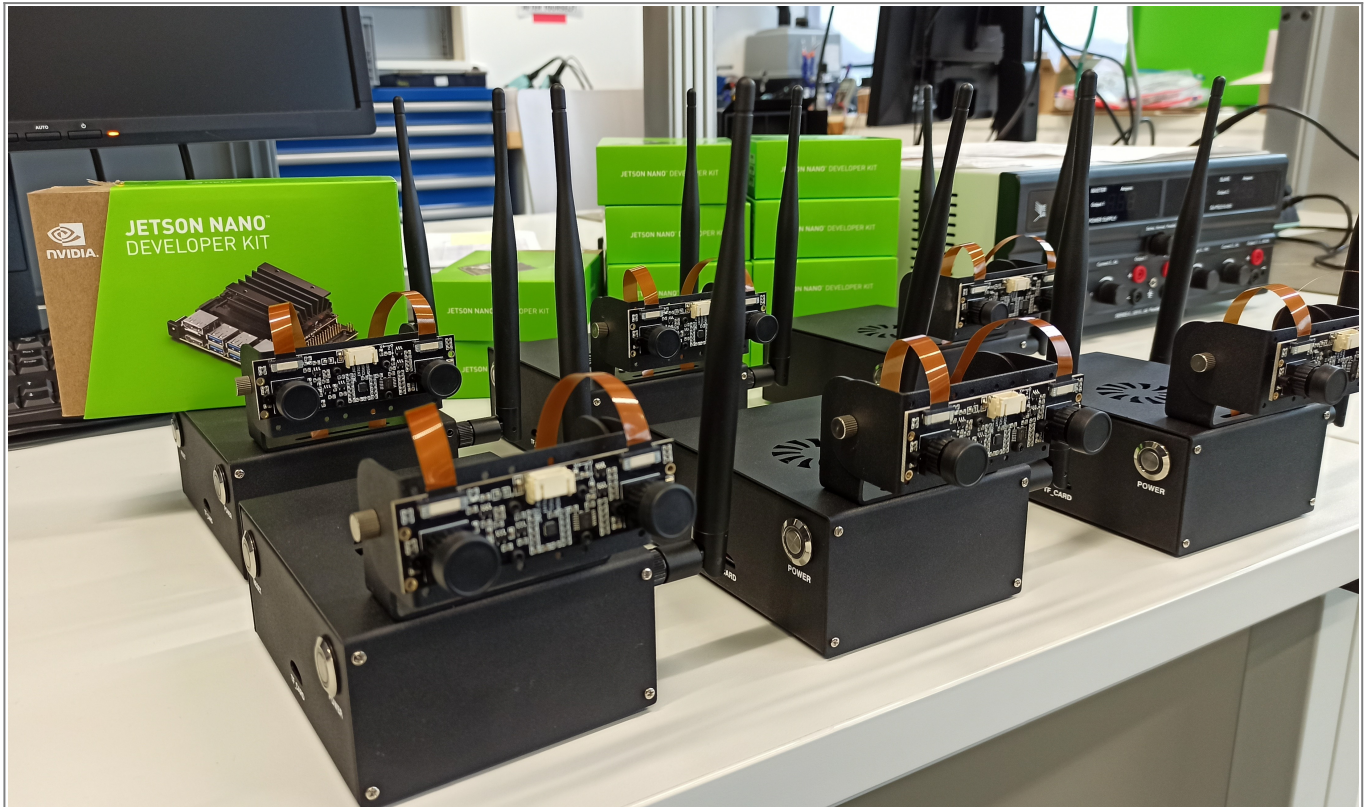
Powered by NVIDIA Jetson Nano

Design and create teaching material (brainware, software and hardware) for AI / ML / DL / CV in schools.