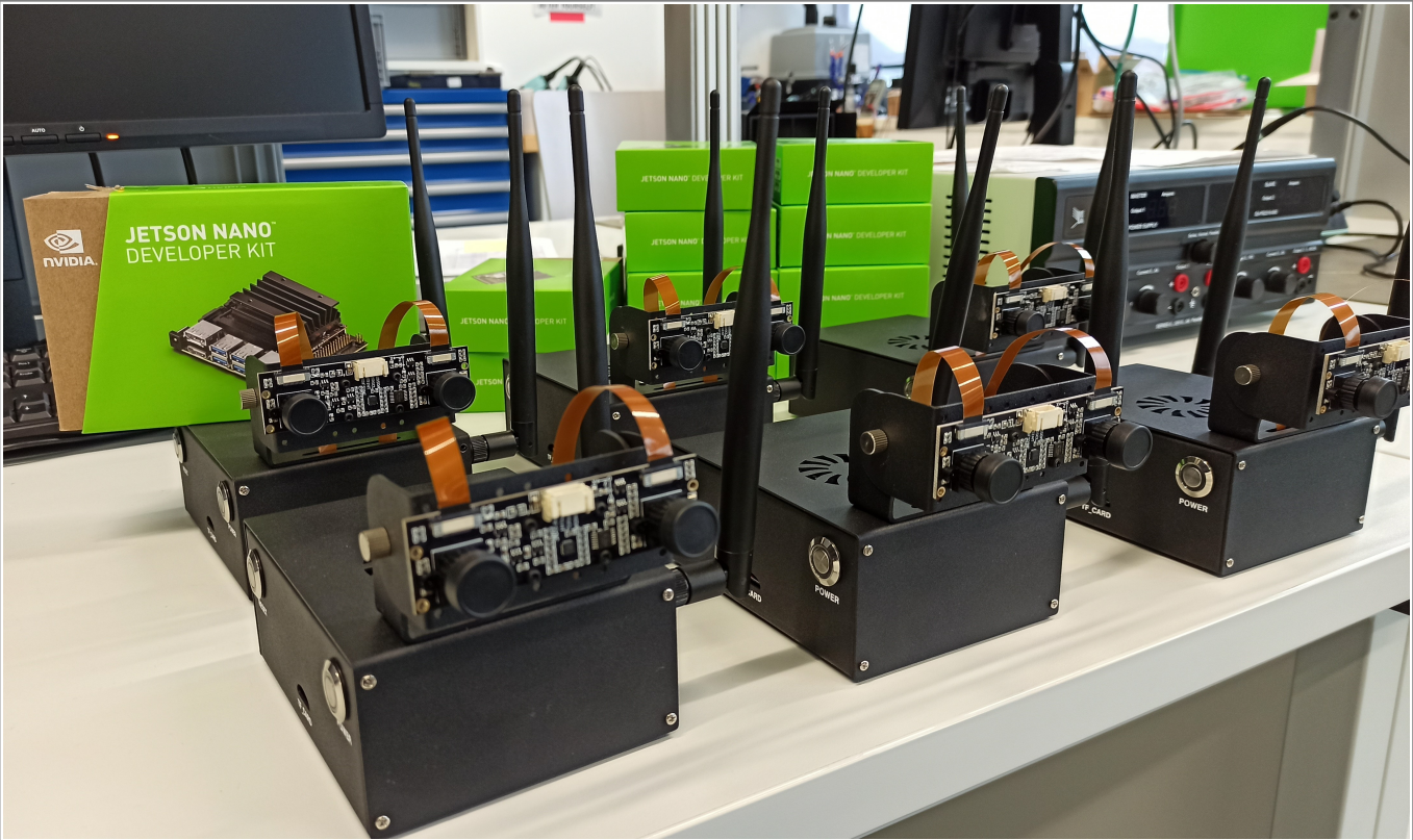
Powered by NVIDIA Jetson Nano