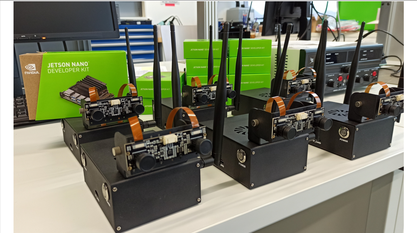
Powered by NVIDIA Jetson Nano