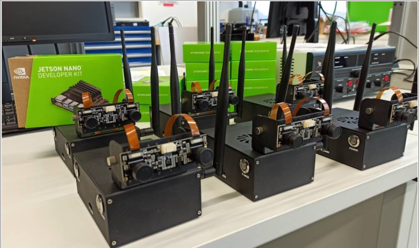
Powered by NVIDIA Jetson Nano