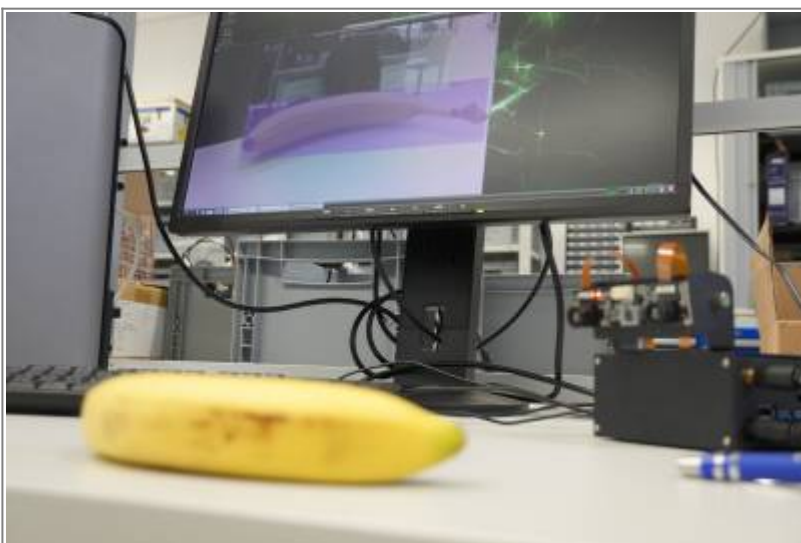
Figure 2: Banana being detected

One way to arouse the interest in children could be handing over Jetsons to the different groups of children and telling them to make their Jetson detect whatever they like to and ask them to make a note of the things or images that their Jetson could not detect correctly during the whole process so that the limitations of Jetson can be known.