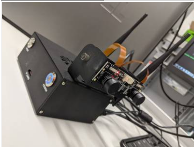
Figure 1: Nano Jetson

Object detection is the means of locating the presence of objects with a bounding box and types or classes of the located objects in an image.