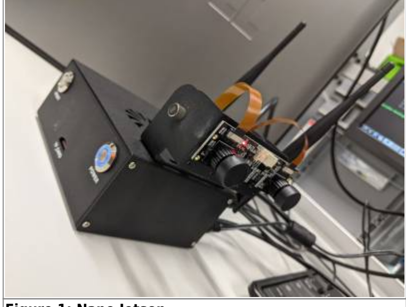
Figure 1: Nano Jetson

Object detection is the means of locating the presence of objects with a bounding box and types or classes of the located objects in an image.