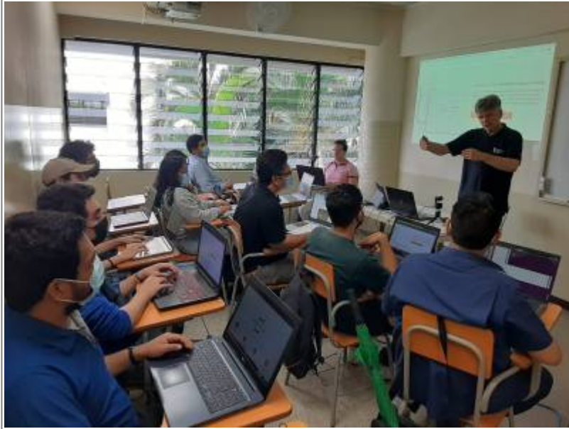
Fig.: Great audience! 😊