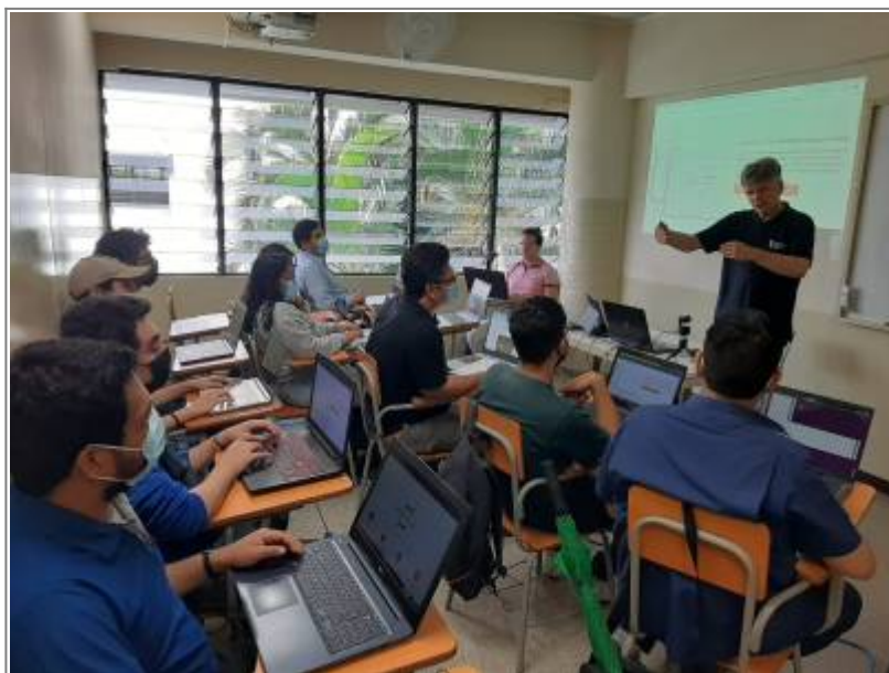
Fig.: Great audience! 😊

Rolf Becker, Clein Sarmiento, 2022-09-01