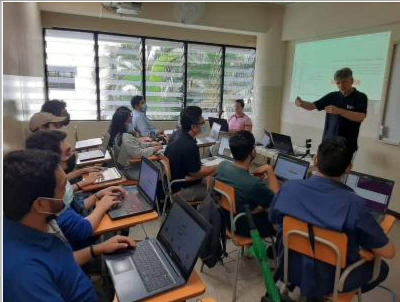
Fig.: Great audience! 😊