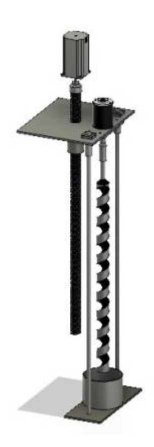
Check 3D model here