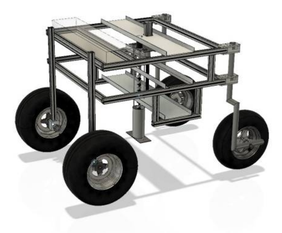
Check 3D model here