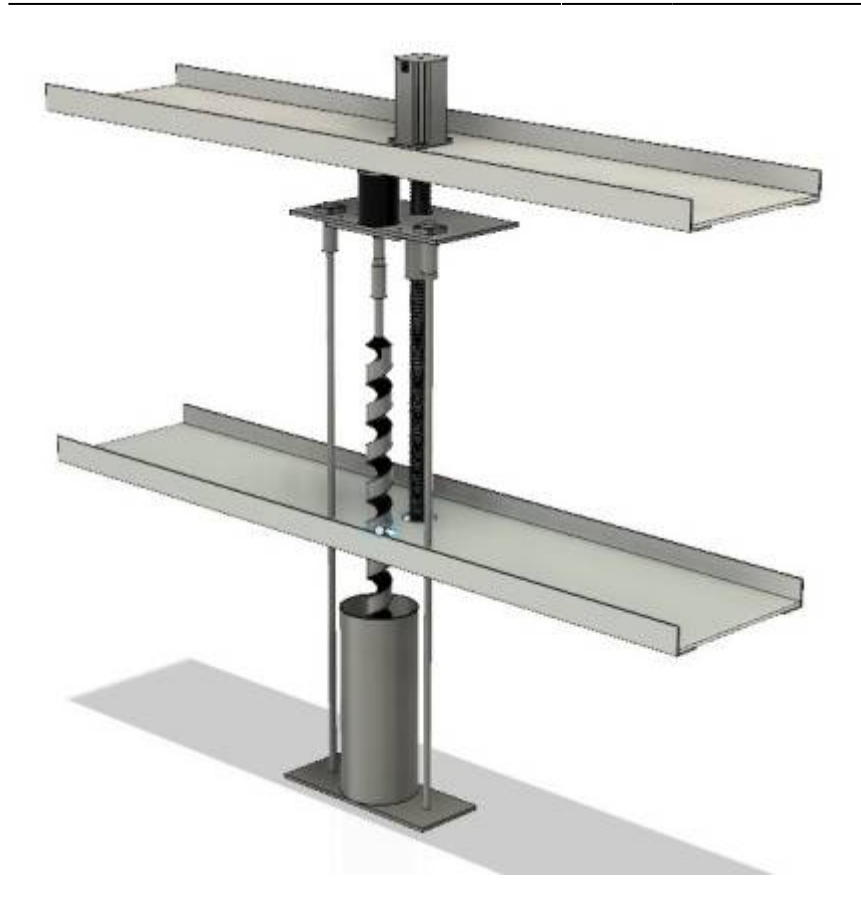
How it would look like on the FarmRobot:

2025/06/06 05:32 5/9 Soil sampling machine