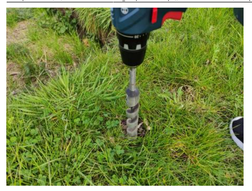
The second time, I got to drill 50cm, which is the total length of the bit.