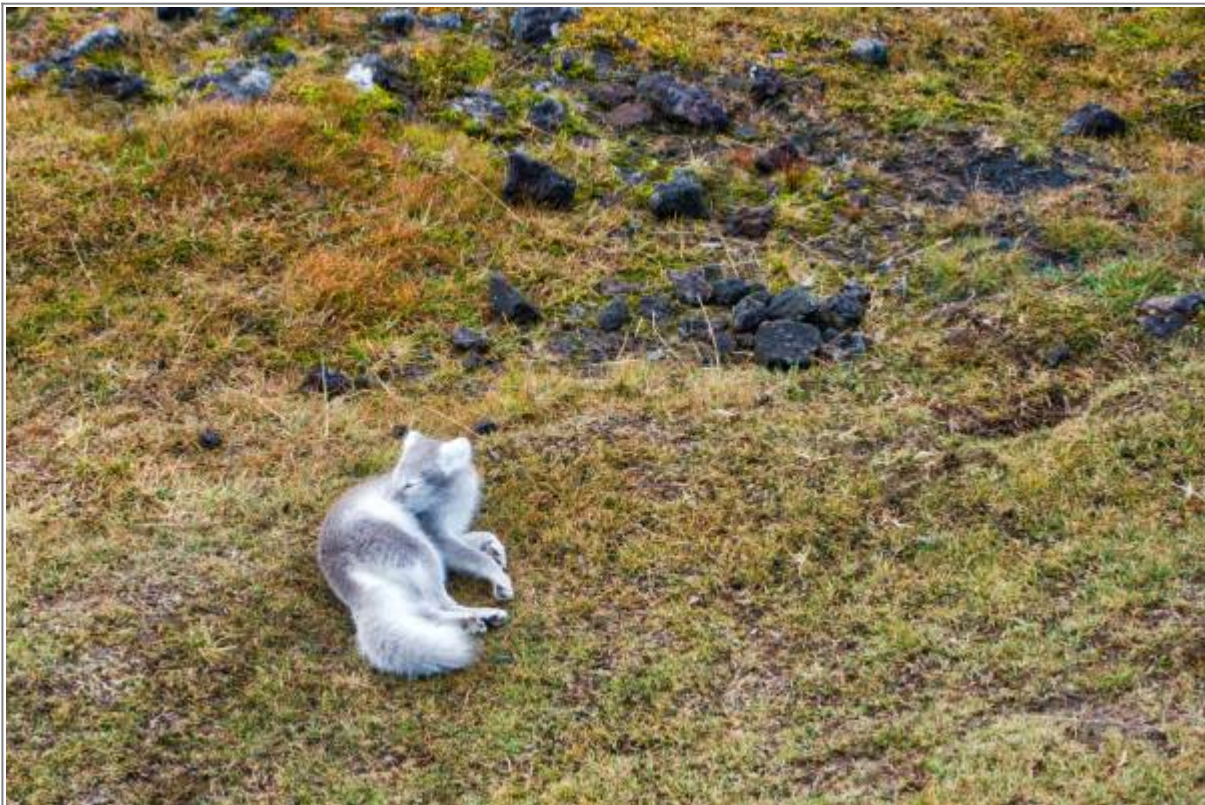
Photo: Polar Fox on Iceland, Sept. 2019