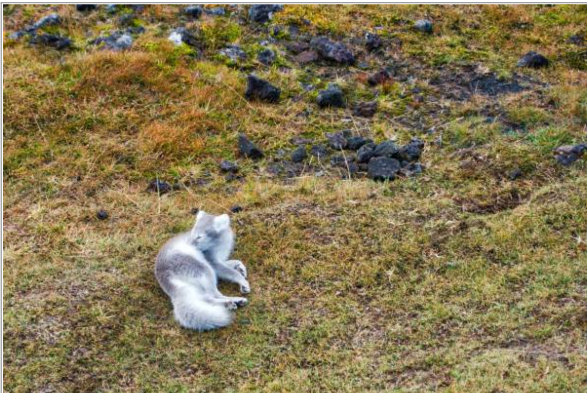
Photo: Polar Fox on Iceland, Sept. 2019